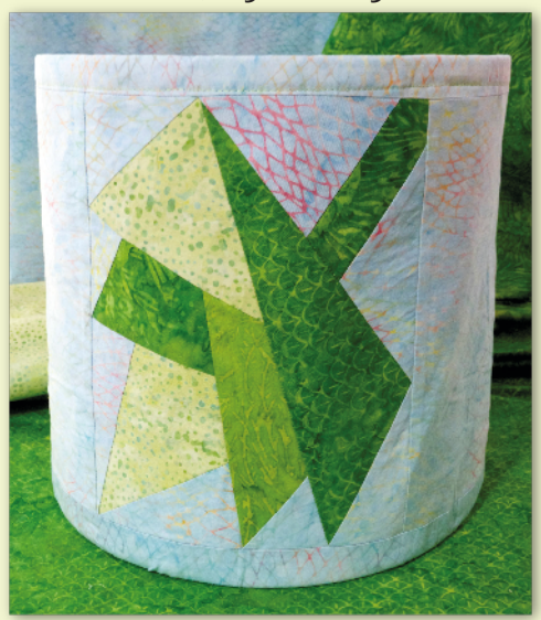
You will need: TAB-59 Autumn Breeze Pattern FQG I 22 Stacking Pop-Up Pattern FQG I 24 Large I 0.5" Spring Refill