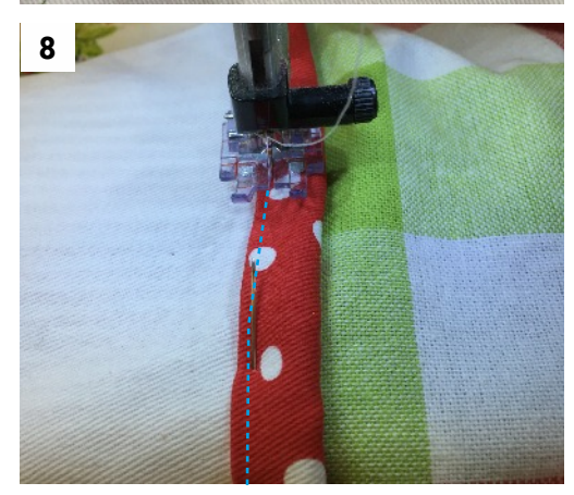
FAT QUARTER GYPSY