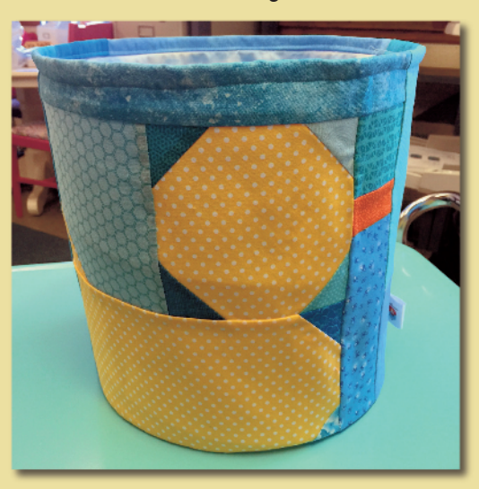
You will need:

SC103 Duck, Duck, Goose! Quilt Pattern FQG122 Stacking Pop-Up Pattern FQG124 Large 10.5" Spring Refill