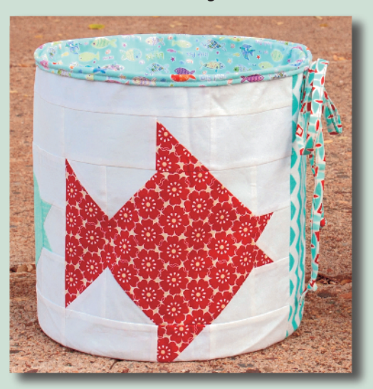
You will need:

SC104 Just Keep on Swimming Quilt Pattern FQG122 Stacking Pop-Up Pattern FQG124 Large 10.5" Spring Refill