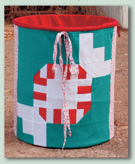
You will need:

SC106 Peppermints Quilt Pattern FQG122 Stacking Pop-Up Pattern FQG125 Extra Large 14" Spring Refill