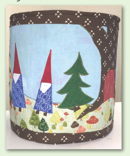
You will need: A Row of your Choice FQG I 22 Stacking Pop-Up Pattern FQG I 24 Large I 0.5" Spring Refill